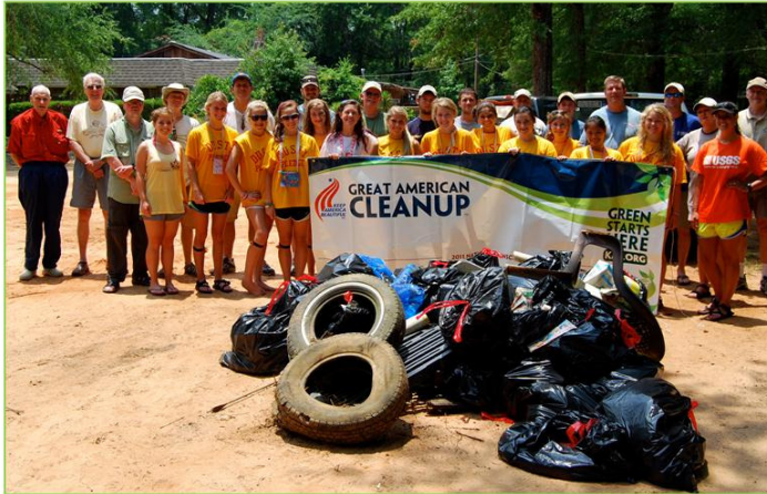
All of the volunteers outside of Boyette's Fish Camp with the trash they collected.

The East Mississippi Foothills Land Trust (EMFLT) sponsored their bi-annual Chunky River Cleanup on Friday, June 10, 2011. The volunteers, including the Dusty Social Service Club, Natural Resources Conservation Service (NRCS), Mississippi Power, United States Geological Service (USGS), East Central Community College, and ECCC Environmental Club, canoed the Chunky River picking up litter along the riverbed, in the water, and at the landings. Even in the 95 degree heat and with the river being low, over 600 pounds of trash were collected! One of the primary goals was to show the volunteers how quickly trash accumulates. These young people now have a new understanding of the effects of littering. It is EMFLT's hope that they become a