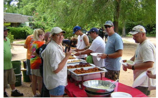
Eating at Boyette's Fish Camp

The EMFLT will sponsor their bi-annual river clean-up on Friday, June 10, 2011 . The main goal of this project is to educate the volunteers on how quickly trash accumulates in the river and for the volunteers to see and understand the effects of littering. Hopefully, by having a close-up view of the pollution, the volunteers will become a crusader among their peer groups to promote a cleaner environment.